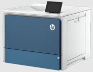
HP Color LaserJet Enterprise 5700dn shown in default Atmosphere Blue color panel option