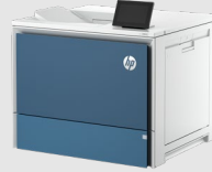
HP Color LaserJet Enterprise 6700dn shown in default Atmosphere Blue color panel option