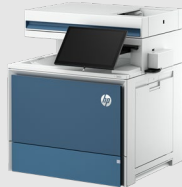
HP Color LaserJet Enterprise MFP 5800zf shown in default Atmosphere Blue color panel option