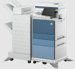
HP Color LaserJet Enterprise Flow MFP 6800zfw+ shown in default Atmosphere Blue color panel option