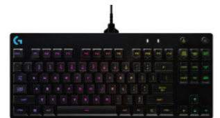
PRO WIRED GAMING KEYBOARD