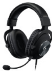
PRO X GAMING HEADSET

PRO SERIES GEAR helps esports players take first place faster than ever. Designed in collaboration with many of the world's top esports athletes, PRO gear features the latest technology and the most refined performance, so absolutely nothing gets in the way of winning.