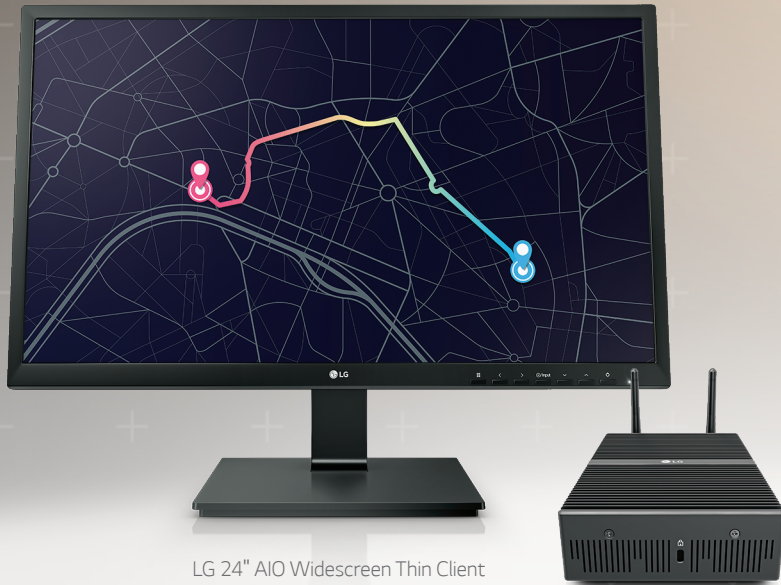
LG 24" AIO Widescreen Thin Client