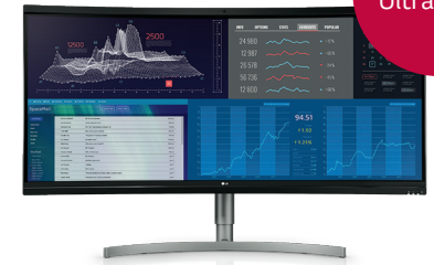
LG 38" AIO Curved UltraWide® Thin Client 38CK950N-1C