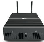
LG Thin Client Box CK500W-3A