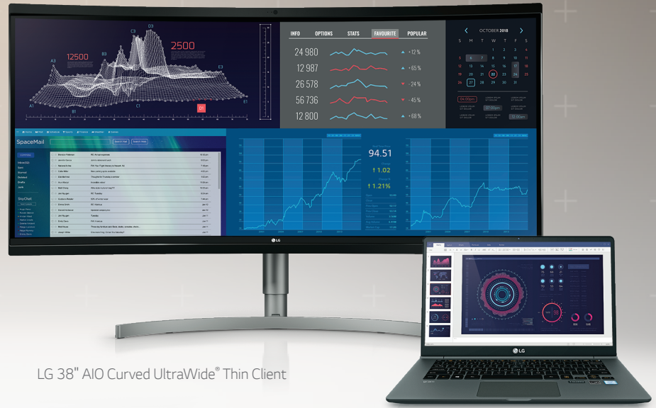
LG 38" AIO Curved UltraWide® Thin Client

LG Thin Clients are designed for wherever security, manageability, and streamlined user experience are crucial factors for success. Whether deployed in data-heavy healthcare and finance contexts or cost-sensitive higher education settings, every LG Thin Client has inherent security to protect sensitive data and simplified management to minimize potential downtime.