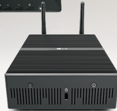
LG Thin Client Box