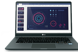
LG Mobile Thin Client 14ZT980-G