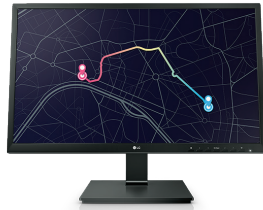
LG 24" AIO Widescreen Thin Client 24CK550W