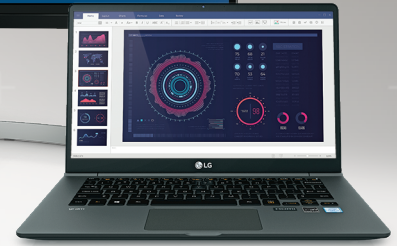
LG Mobile Thin Client